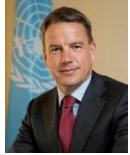
Christian Friis Bach

President of the Jury UN Secretary General's Special Envoy for Road Safety